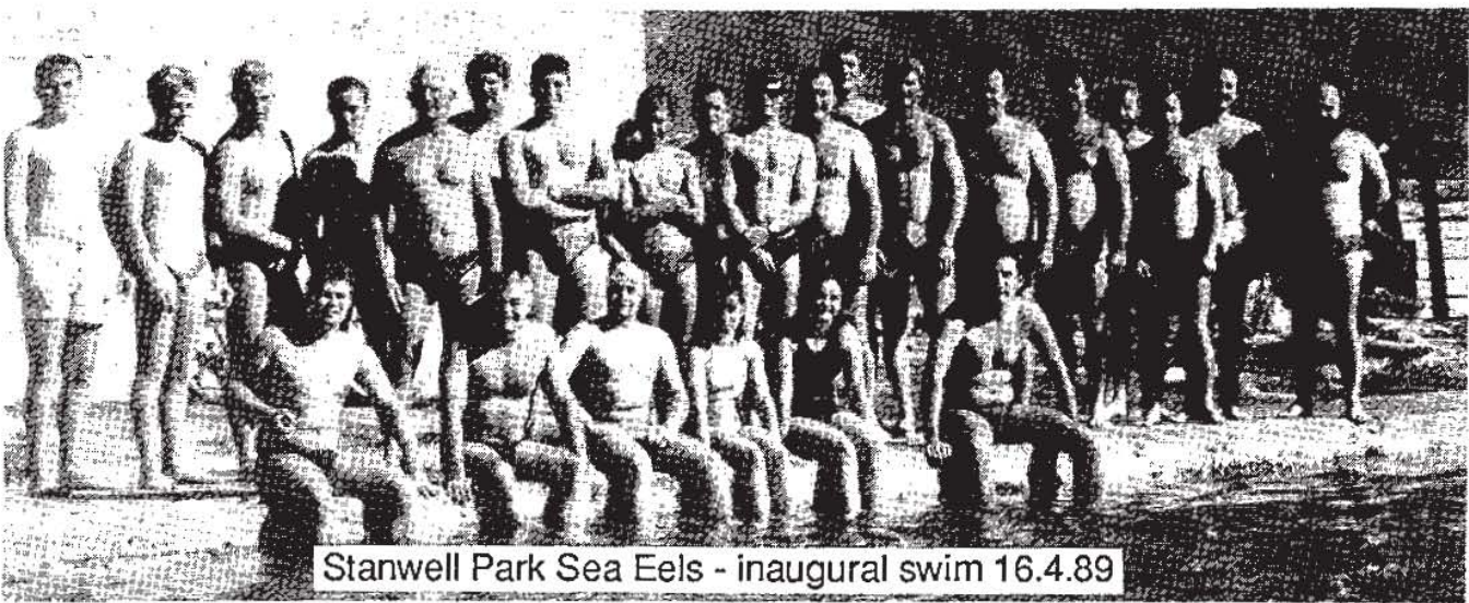
Stanwell Park Sea Eels - inaugural swim 16.4.89