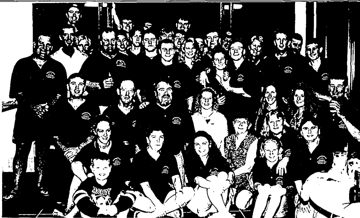
The Australian Touring Team barbecue at Kurrawa