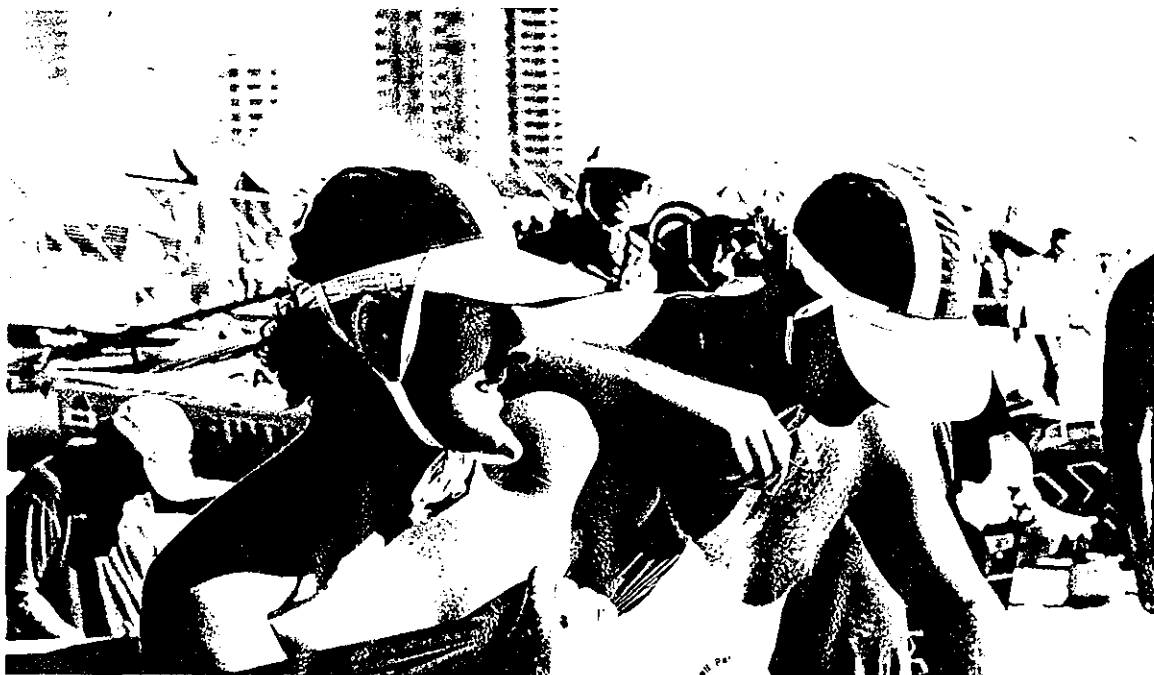
Two of our fine boaties checking out the surf at Kurrawa beach