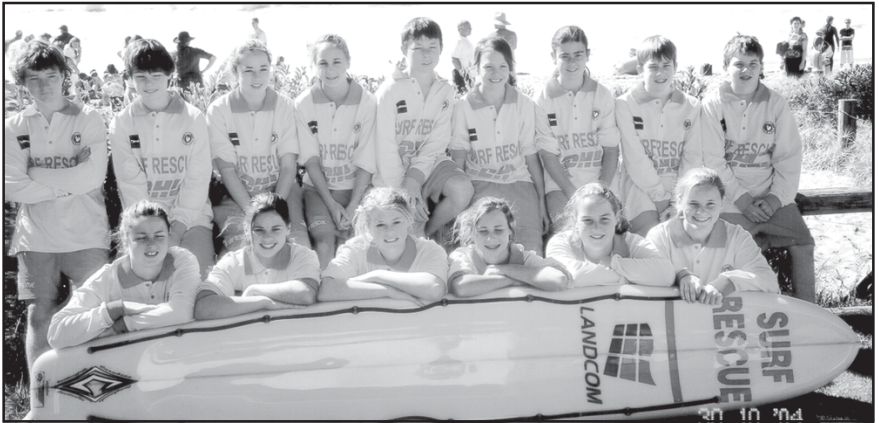
One of two rescue boards donated by Landcom