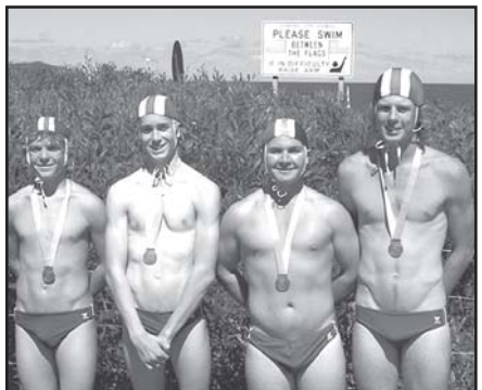
Bronze to the U/19 Mens Relay Team at the 2005 State Championships