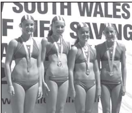
Gold to our U/15 Girls Relay Team at the 2005 State Championships