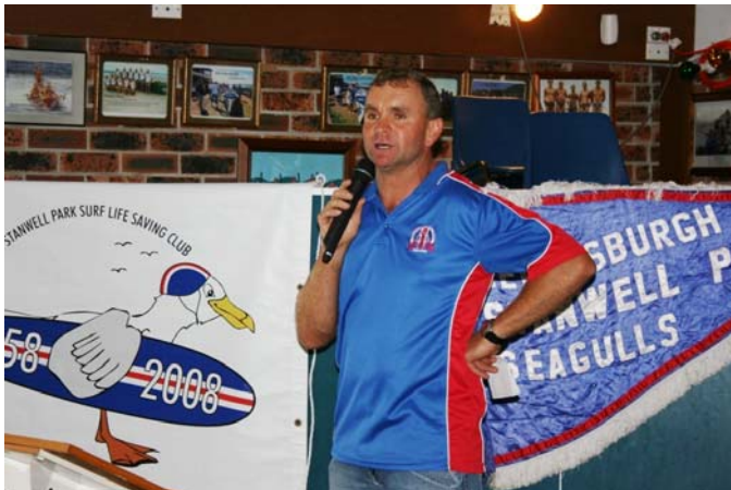
Don Burke at the Seagulls 50 th Anniversary