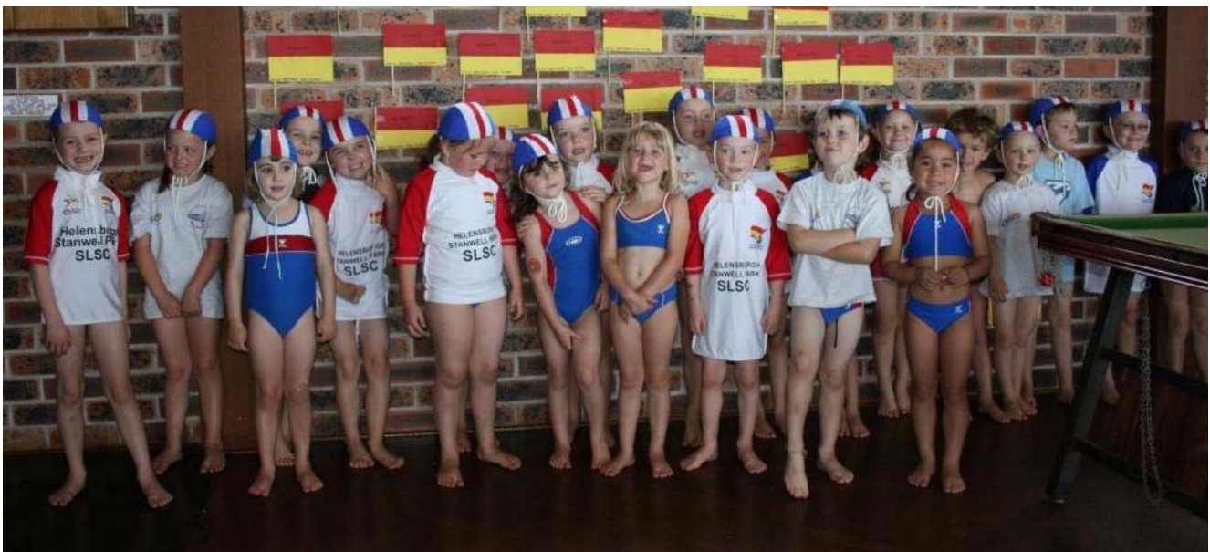
Our future lifesavers - Under 6 year members