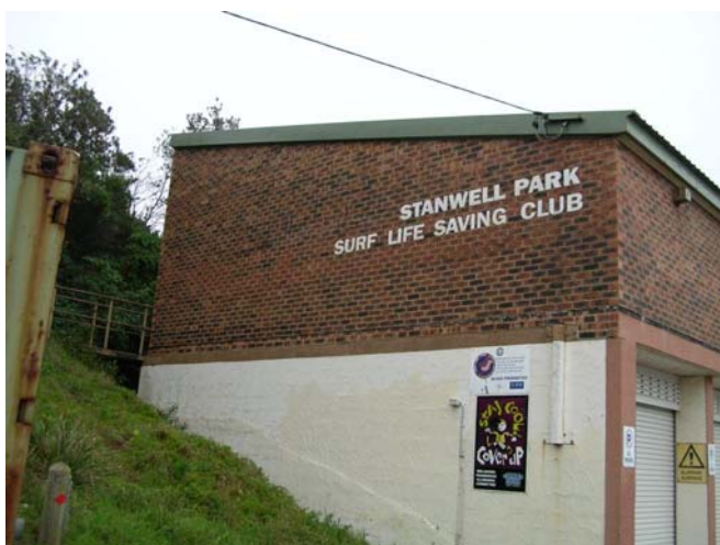
"Helensburgh" was removed by an unknown person during the year

Our full Club name has been displayed on the western side of the building for nearly 20 years. Someone however does not like "Helensburgh" being a part of the name, and went out of their way to remove those letters in the early months of 2009.