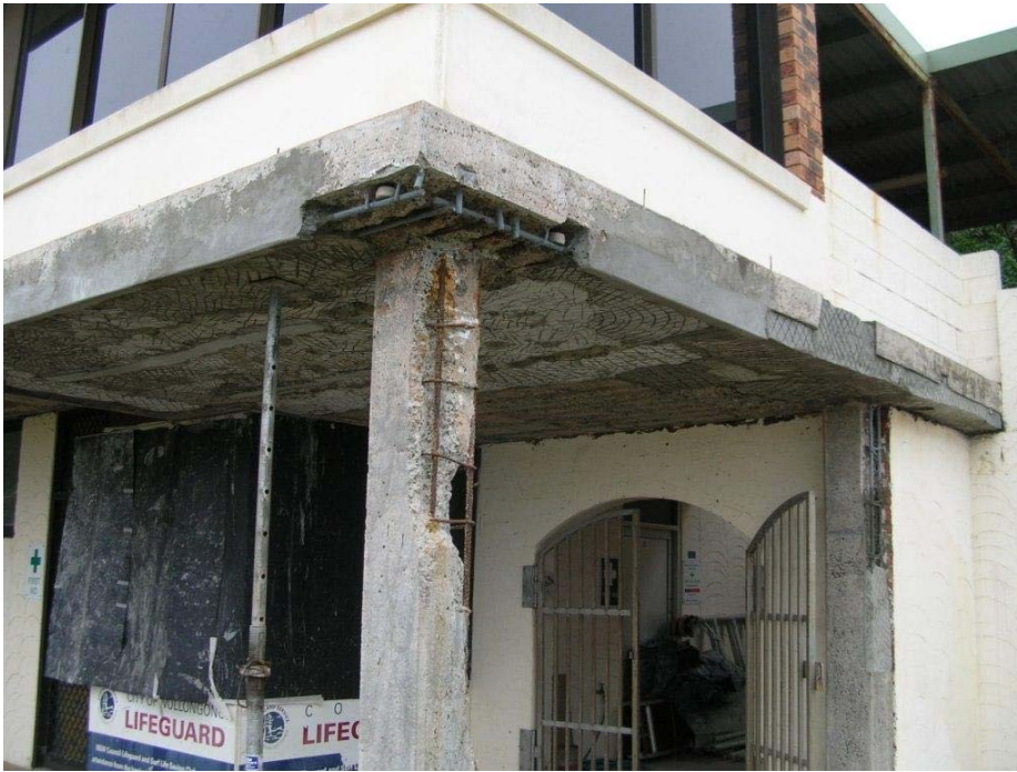
This photo shows the extent of repairs being undertaken to the north-eastern corner of the Club building by Wollongong City Council.