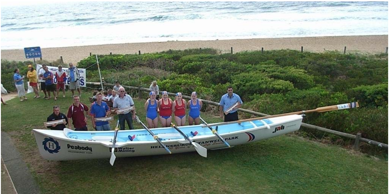
Christening of "The Centenary" surf boat

Members continue to be covered by NSW Government Emergency and Rescue Workers Compensation Fund for medical and hospital expenses incurred as a result of an injury whilst involved in an approved surf club activity. Members who become incapacitated and unfit for work as a result of an injury, are also re-imbursed for loss of wages for a limited period.