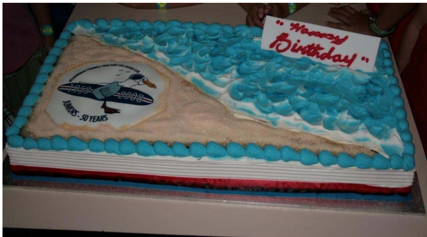
Seagulls 50 th Birthday cake