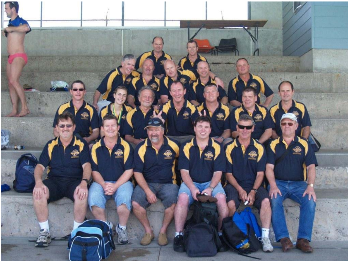
Stanwell Park Sea Eels – Touring team 2008 Australian Championships