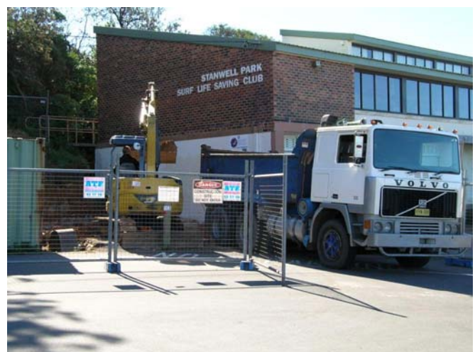
Excavation to remove embankment for construction of storage facility for Council lifeguards, July 2009