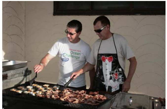
Ocean Swim - breakfast for the workers