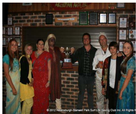
Patrol of the year no. 2 – Congratulations Patrol no. 2