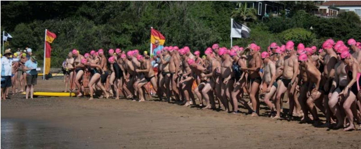
The pink hats take off for the beginning of the 2012 Ocean Swim