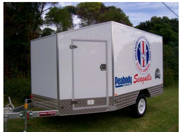
United Mineworkers Federation Helensburgh donated $3,000 towards the cost of a new gear trailer for the Juniors with $2,780 chipped in from Peabody funding

The Junior section sought sponsors to subsidise the purchase of uniforms for its State team members, raising $3,600 of the total cost of $4,970. Sponsors were St George Bank, KMA Media Enterprises of Helensburgh, Tri-Clark Brothers Excavations of Helensburgh, and Al's Gourmet Meats of Helensburgh