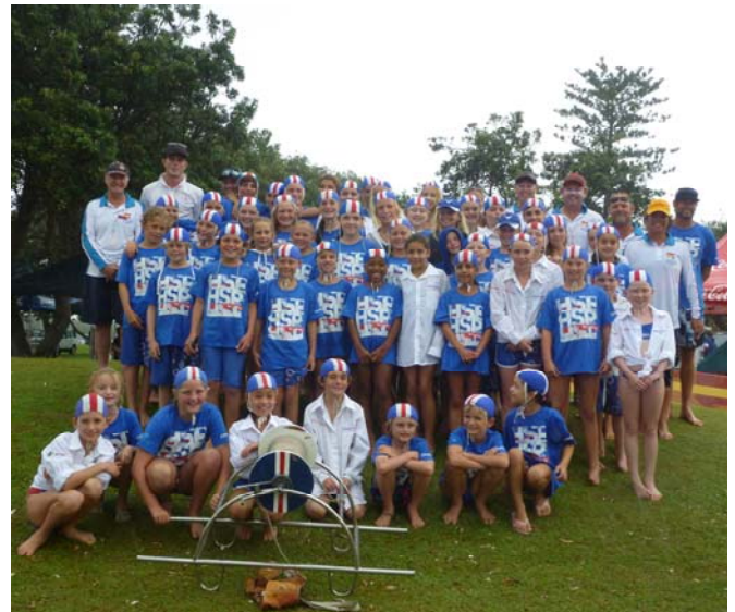
The Junior State Touring Team up Kingscliffe NSW