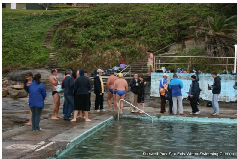
A chilly morning swim for our winter swimmers. Winter Swimming maintains its fun side and keeps the social fires burning through the traditional winter off season. The Winter Swimmers are always on the look out to welcome new members into the fold to enjoy a swim and a laugh