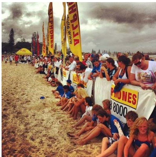
Strong club spirit and camaraderie shown in all competition at "The Park". This photo taken trackside up the junior State Titles Kingscliffe, Nthn NSW.