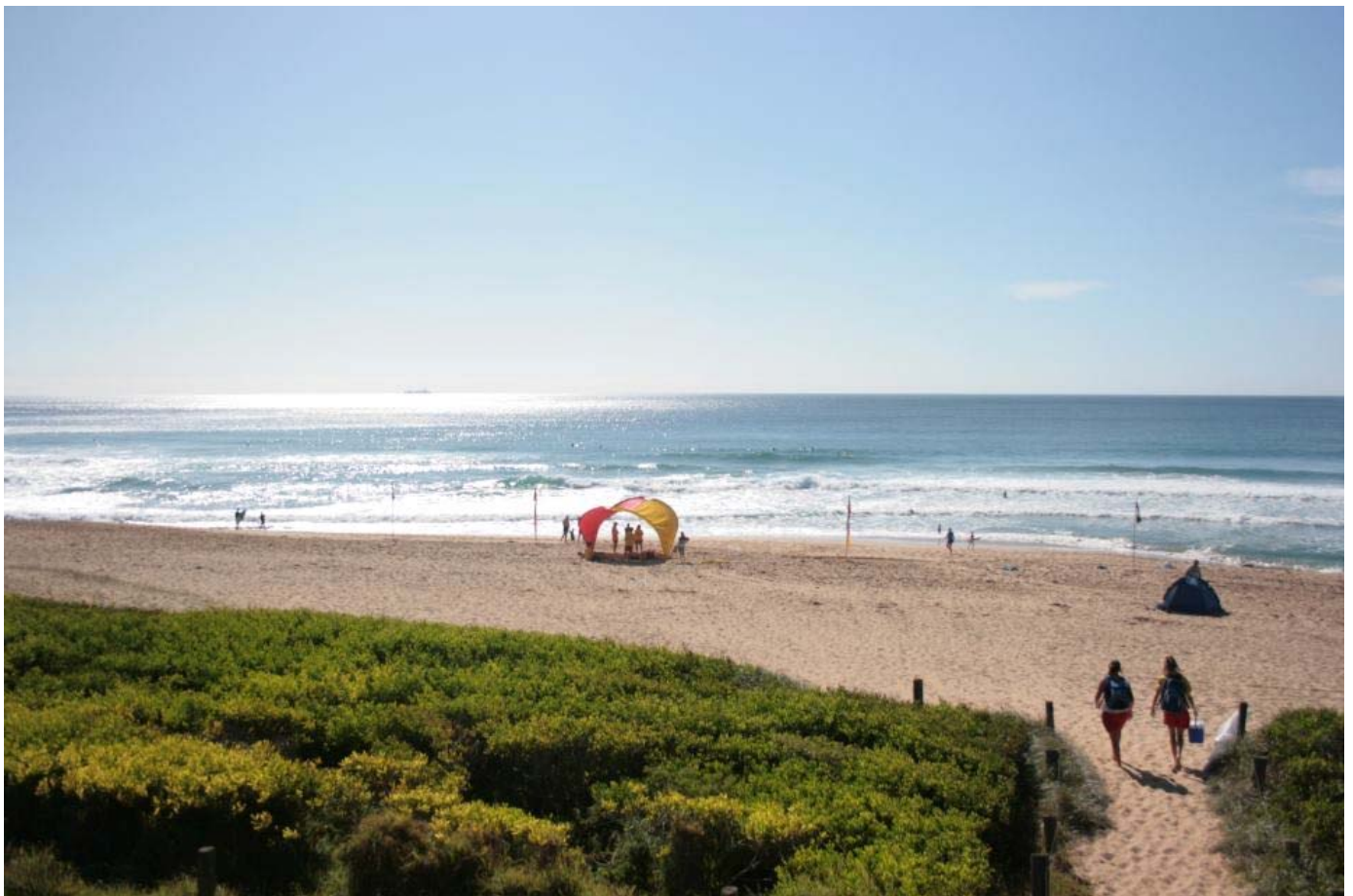
A Rare sunny day for season 2011-12 – Thanks to all members for your efforts the season just gone