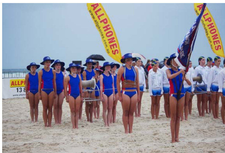
Juniors March Past Team – 2 nd at the Illawarra Branch Championships