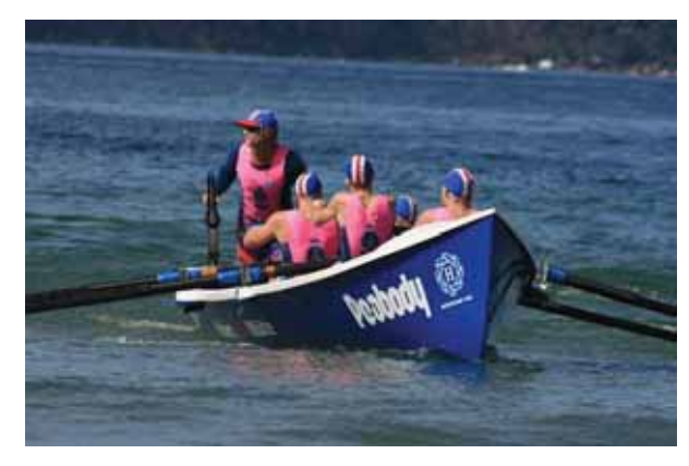
The U19 fellas looking to pick a runner at the NSW State titles. The boys competed strongly all year culminating in a break through 5th in the U19 Australian Championship Final in Perth

You Boys had a fantastic season improving every week and should be very proud of your efforts and what you have achieved in a short time. You are the most successful junior crew the club has produced and the first junior crew to make the Australian Final, congratulations on those wonderful results.