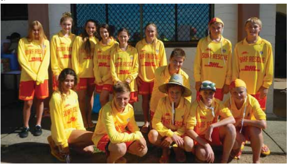
This years latest crop of SRCs parading their newly acquired patrol uniforms. Welcome to the Lifesaving Life!