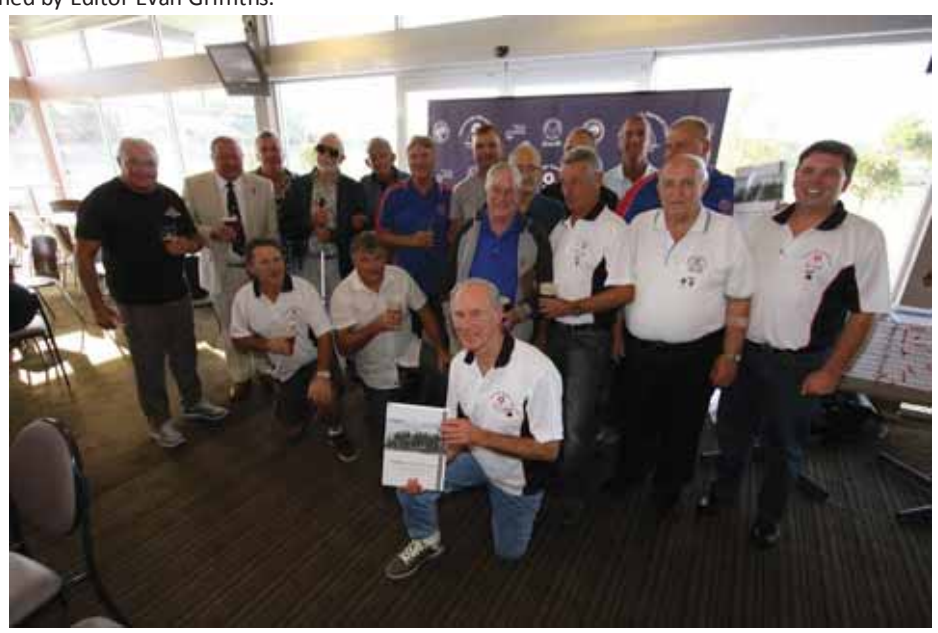
18 of the 27 living Life Members of HSPSLSC were on hand for the launch of the clubs 100 year Book – Vigilance and Service. The Launch too place at the Helensburgh Workmens, Sports and Social Club on the 13<sup>th</sup> April 2014. Copies available now but selling fast so get yours now so you don't miss out!!!