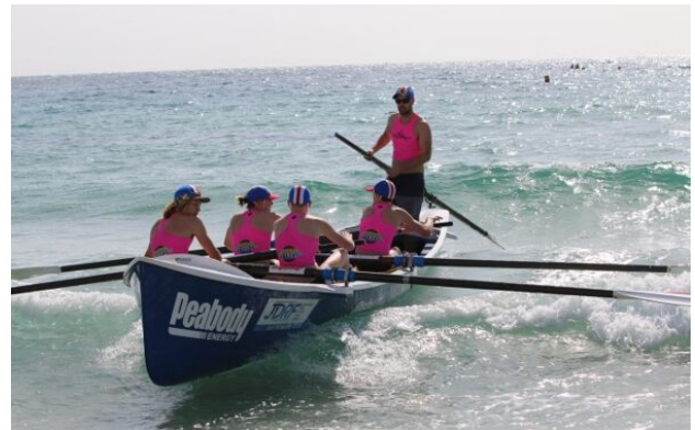
2017 U/19 Female Boat Crew in action.

again 1 short of the final finishing 9 th overall. A solid first season for the girls!