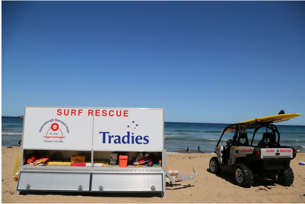
Patrol shelter displaying Tradies sponsorship and ATV

There were 2 significant grants and sponsorships during the season. The first being from Tradies who have continued their support of surf lifesaving activities on Stanwell Park Beach and then they went further to donate funds to outfit all the club's nippers. Looking forward to seeing them in new uniforms in 2017/2018.