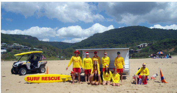
Patrol 6 on the beach Christmas Day 2016

Christmas day was busy as usual and Patrols 6 and 7 were on duty.