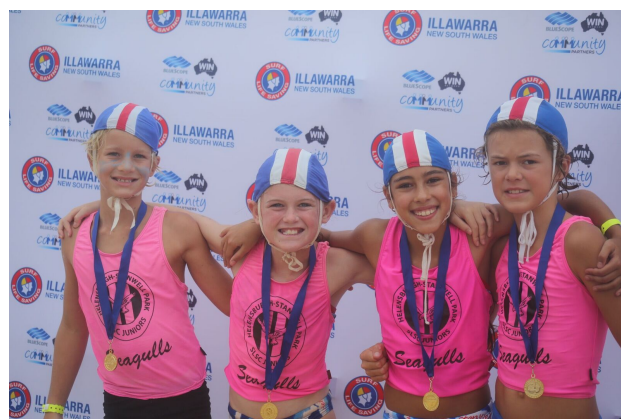
Branch championships U/10 beach relay team 1st