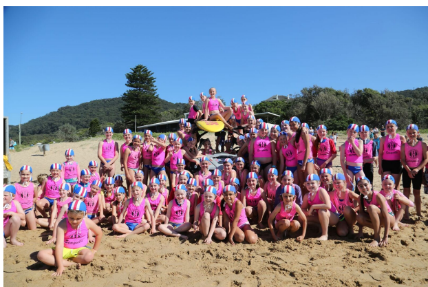
Nippers with the new ATV.