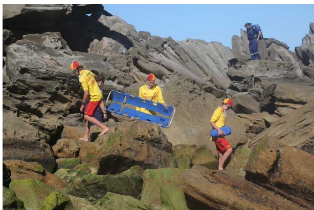
Patrol Members assisting with the rescue on 20 Jan.

A demonstration of the commitment to life saving was on Saturday, 20 January 2018 when a call came from SurfCom that members of the public would need to be evacuated from the Royal National Park due to an approaching bushfire. A message to the clubs "Emergency Callout Team" and subsequent message to the patrolling membership resulted in more than 20 members attending. During the afternoon patrols members supported emergency services with the airlifting of an injured patient from the rescue at the north end of the beach, including setting up a helicopter landing area in the park. Fortunately, the evacuation did not proceed and after about 4 hours of readiness the Emergency Callout Team was stood down. The response by members did not go unnoticed by emergency services or SLSNSW with notes of praise received after the event.