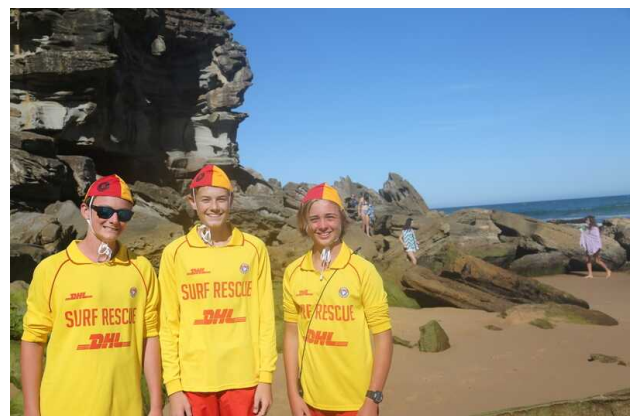
Patrol Members involved in the rescue on 20 Jan