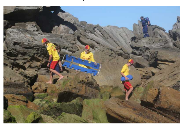
Patrol Members assisting with the rescue on 20 Jan.

A demonstration of the commitment to life saving was on Saturday, 20 January 2018 when a call came from SurfCom that members of the public would need to be evacuated from the Royal National Park due to an approaching bushfire. A message to the clubs "Emergency Callout Team" and subsequent message to the patrolling membership resulted in more than 20 members attending. During the afternoon patrols members supported emergency services with the airlifting of an injured patient from the rescue at the north end of the beach, including setting up a helicopter landing area in the park. Fortunately, the evacuation did not proceed and after about 4 hours of readiness the Emergency Callout Team was stood down. The response by members did not go unnoticed by emergency services or SLSNSW with notes of praise received after the event.