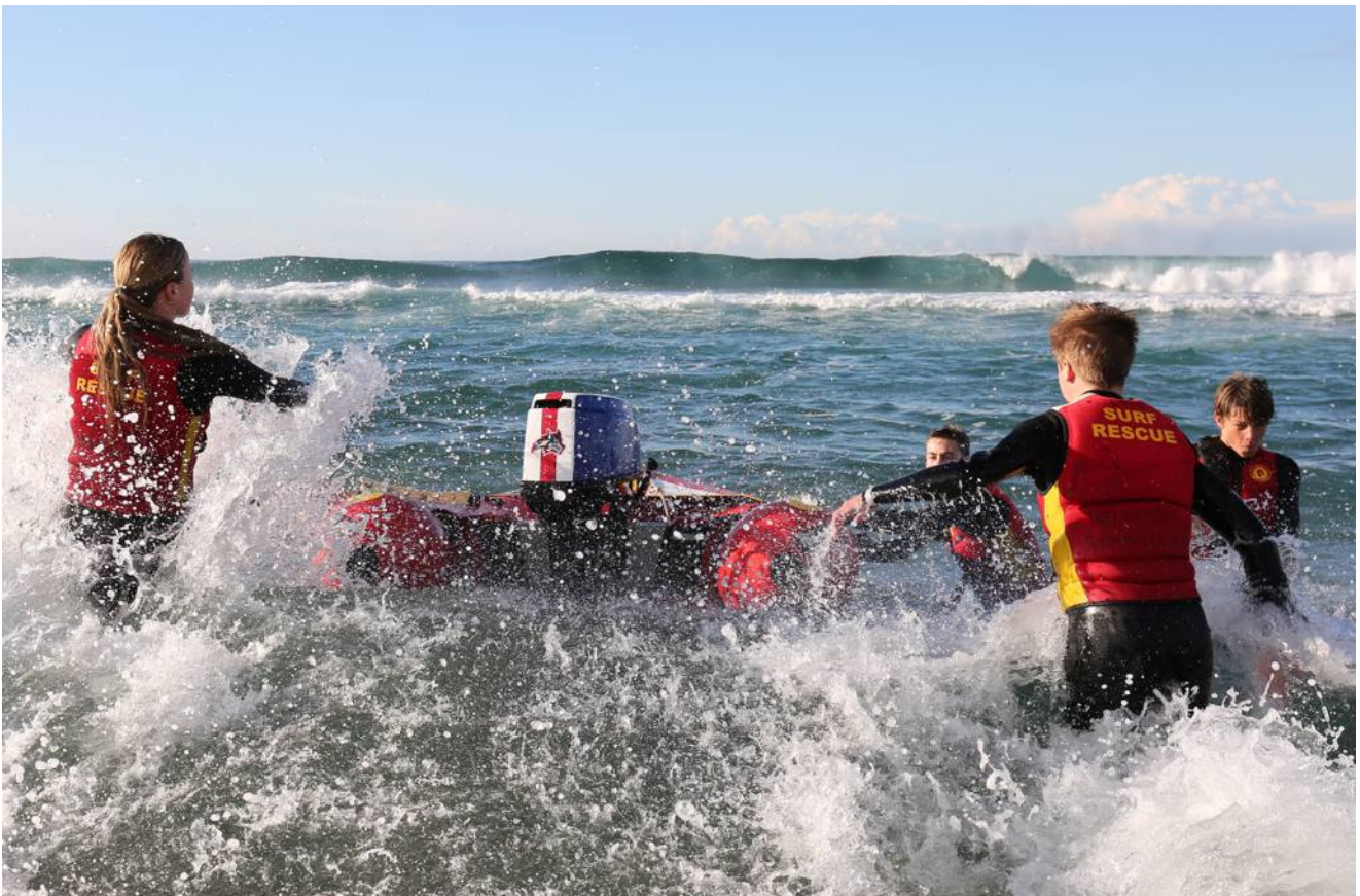
Photo: Launching the IRB