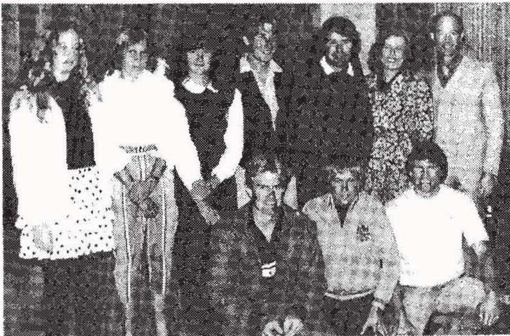
PATROL No. 4.